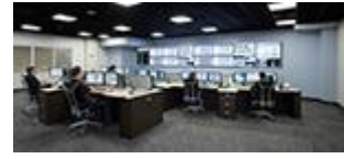
Technical Support Services