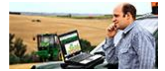
Wireless & Mobility