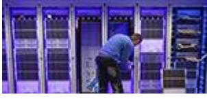
IT Network Services