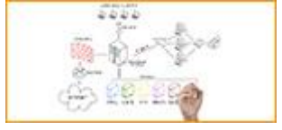
IT&C System Integration